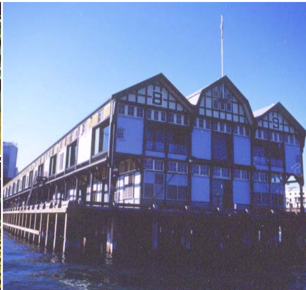
APP CORPORATION PTY LIMITED